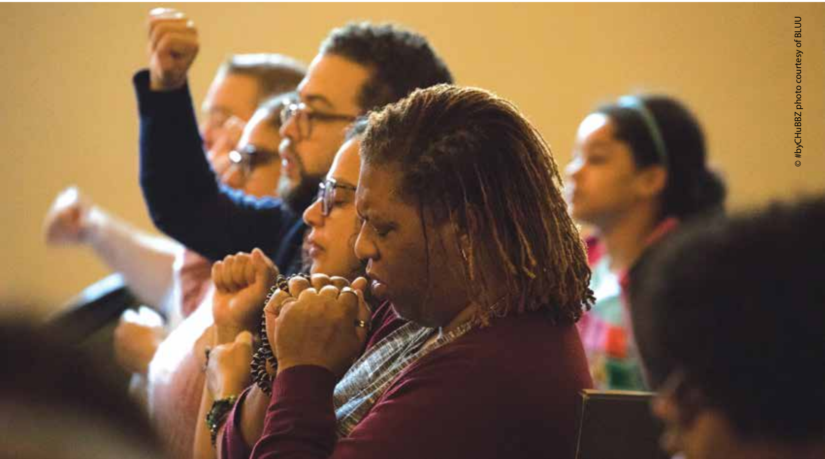
Participants at the Harper-Jordan Theological Symposium sponsored by Black Lives of Unitarian Universalism, Fall 2019.